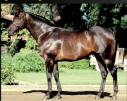
IN EXCESS (Ire)